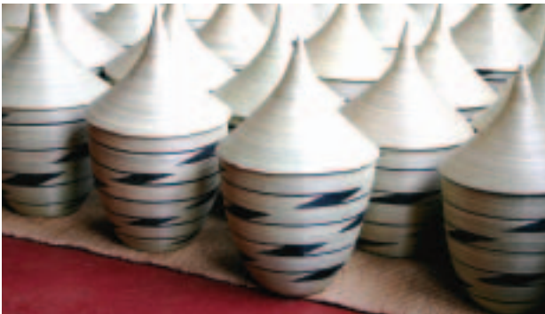
Baskets woven as part of the Macy's/Rwanda Path to Peace Partnership.

UNIFEM's support to the women of Rwanda extends beyond economic empowerment. It also includes helping women participate in the political process. In 2001, UNIFEM prepared women to engage in national debate about the new Constitution. UNIFEM supported female parliamentarians to travel throughout the country, to talk to women about the draft Constitution and solicit their feedback. The issue of women's representation in Parliament was hotly debated. During 2004, Rwanda became the country with the highest number of women parliamentarians. Building on that success, UNIFEM also set up a women's caucus in Parliament to review discriminatory laws, granting women the right to inherit property.