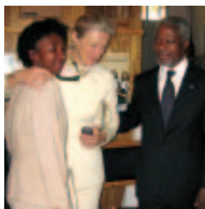
Secretary-General Kofi A. Annan and Mrs. Nane Annan in Madagascar speaking with a woman living with HIV/AIDS.

In the course of three decades, UNIFEM's efforts in more than 100 countries, from Liberia to Afghanistan, have touched the lives of countless women. UNIFEM has helped raise awareness of gender-based violence, and helped women speak up against it. It has promoted women's political participation, and worked for their economic empowerment. It played a key role in the passage of Security Council resolution 1325, which placed firmly on the agenda the needs of women in societies in armed conflict, while creating a political framework for women's role in peace-building. Tonight, we join women around the world in offering thanks and best wishes to UNIFEM on its 30th anniversary.