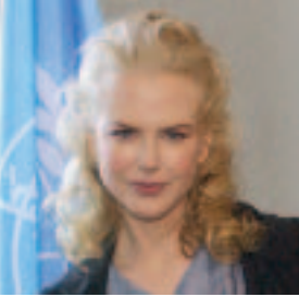
Nicole Kidman UNIFEM Goodwill Ambassador

I am truly honored that UNIFEM has asked me to serve as Goodwill Ambassador. It's likely my most challenging role, and I know that I have an enormous amount to learn. But by committing myself to what I feel will be a life-long involvement, I can gain the necessary experience to be an effective messenger on UNIFEM's behalf. With the guidance of UNIFEM's Executive Director Noeleen Heyzer, and by meeting and listening to women who face and overcome extraordinary challenges – poverty, war, violence, discrimination – I hope to educate people around the world through my own education.